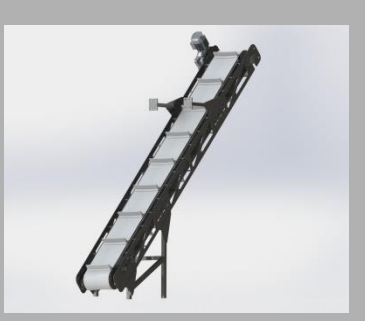
Belts with blades, loade