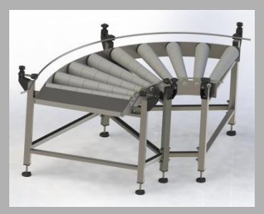
Curved belt with rollers